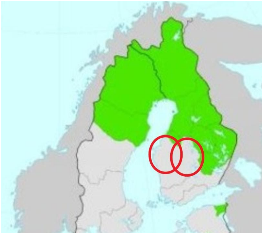
Picture 1: Map of Just Transition Fund proposed territorial eligibility (green) and areas heavily affected by transition away from peat (South Ostrobothnia and Central Finland), that are not included in the Commissions proposal.